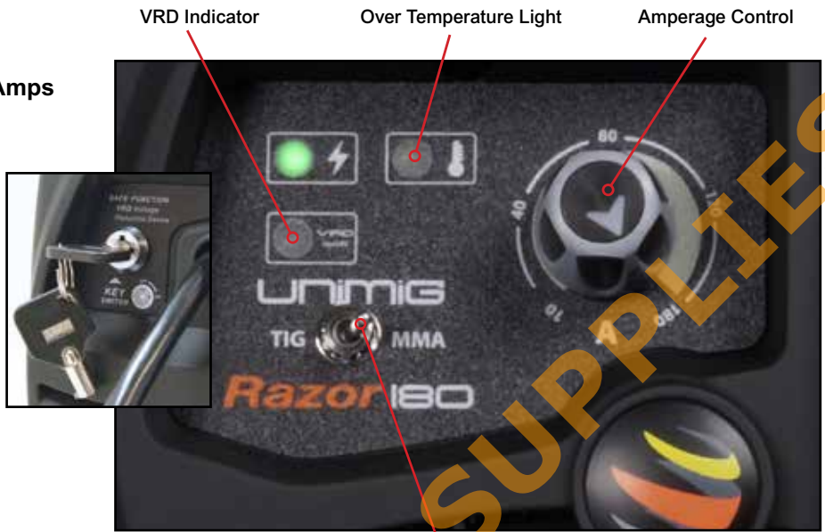
MMA / TIG Toggle Switch