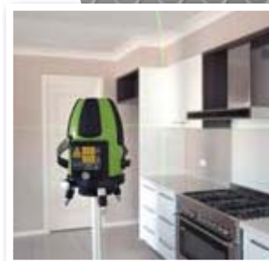
Previous model shown